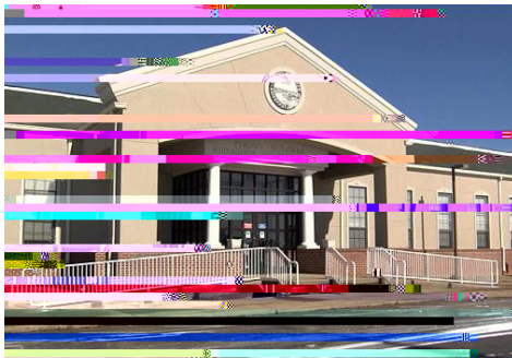
Hamilton County Department of Education is a client of Southern Management an ABM company, now operating as ABM.